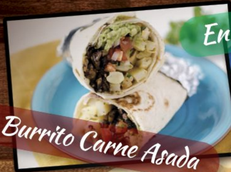
Burrito Carne Asada